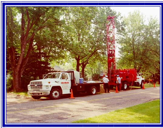
Diedrich D-120 with Ford F-700 Flat Bed Support Vehicle