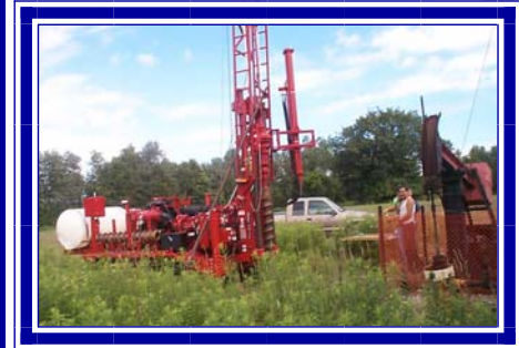
Goes Almost Anywhere!